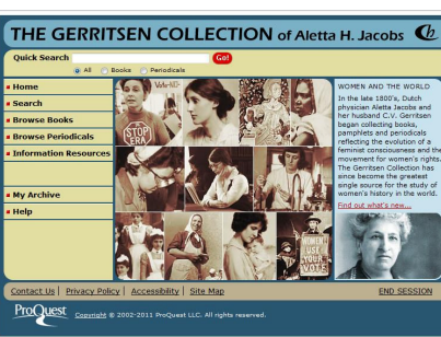
The Gerritsen Collection