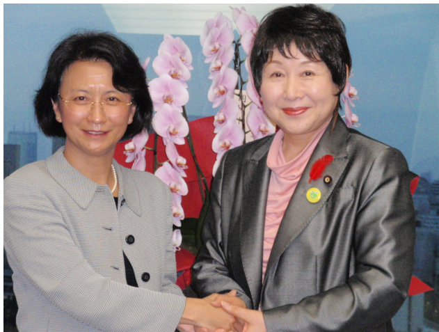
Minister Phavi (left) shakes hands with Minister Okazaki (right)

In the morning the following day on Saturday, October 9, gender equality administrative officials, researchers, and practitioners involved in international cooperation in various capacities joined Minister Phavi in a round table discussion. During the discussion the minister shared her views on gender equality administration and government