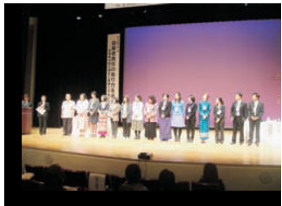
At the National Shelter Symposium in Kurume

The main purpose of this workshop is to deepen a mutual understanding between Japan and Thailand among the stakeholders involved in policies to protect victims of human trafficking in Thailand and to investigate measures that will contribute to strengthening the cooperative roles and activities of multi-disciplinary teams (MDTs) in Thailand. Based on the 2009 Action Plan to Combat Trafficking in Persons, the first half of the 2-weeks workshop consisted of lectures concerning various initiatives of the Cabinet Secretariat, the Gender Equality Bureau of the Cabinet Office, the Ministry of Foreign Affairs, the National Police