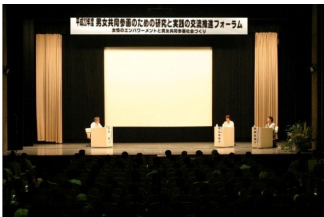
At the Symposium