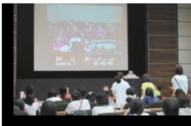
Teleconference with a Korean girls' high school Physics camp

The Science Café, an innovative program for parents and teachers, provided up-to-the minute information and information on general trends in government and the corporate world to parents. Parents and teachers alike found this form of discussion very helpful and a number of them commented that the two-hour session was over before they knew it. In the program for teachers, the participating teachers prepared a simple teaching guide to enable other teachers to incorporate outcomes of this program into the curriculum. Teaching assistants (TAs) from universities and graduate schools also planned fun-filled activities such as the “Science Battle” and “Science Sugoroku ” that enabled students to experience the joy of science as they engaged in friendly exchanges with the TAs.