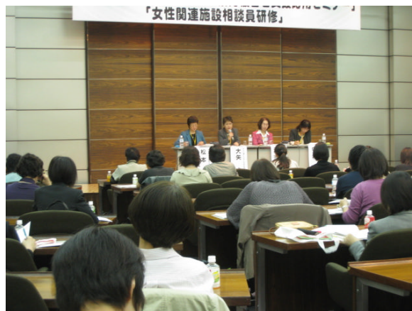
At a plenary session

The participants of this course also attended the Seminar on Support for the Victims of Spousal Violence (Applied Seminar) held during the same period. The program gave participants the opportunity to deepen their knowledge of spousal violence, an issue that must be resolved to realize a gender-equal society. Some of the comments made by participants were: “All the lecturers were wonderful people. I am really happy that I was able to attend this seminar,” “This seminar was truly meaningful and gave counselors a sense of empowerment,” “This seminar enabled me to reaffirm the meaning and responsibility of my own work.”