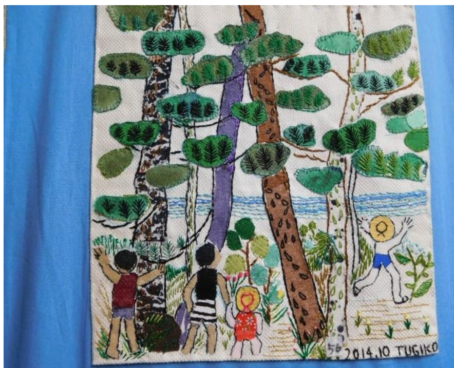
Figure 4 Embroidery made by a woman in the affected area