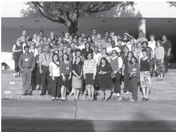
Workshop participants gathered in Honolulu to discuss Gender Equality and Disaster Risk Reduction in August 2004.

In August 2004, the Gender Equality and Disaster Risk Reduction Workshop convened in Honolulu with generous support from workshop sponsors, including the US Agency for International Development (USAID) Office of Foreign Disaster Assistance (OFDA), the US Department of Agriculture (USDA), the National Science Foundation (NSF), UN International Strategy for Disaster Reduction (UNISDR), the Gender and Disaster Network, the East-West Center/Pacific Disaster Center (PDC), the Center of Excellence in Disaster Management and Humanitarian Assistance (COE-DMHA), the Public Entity Risk Institute, and several local organizations. The intent of the workshop was to build on previous workshops and recommendations.