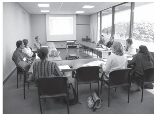
Participants worked in small groups to develop strategies in seven theme areas, which became part of the Honolulu Call to Action presented at the World Conference on Disaster Reduction in Kobe, Japan in January 2005.

Specific recommendations from the 2004 workshop focused on six thematic areas of discussion at the workshop, including: 1) building capacity in women's groups and community-based organizations; 2) improving communications, training, and education; 3) recognizing other forms of knowledge, including women's and indigenous knowledge, as contributions to science and technology used in disaster risk reduction; 4) engendering complex emergencies by recognizing gender issues embedded in these types of disasters; 5) enhancing gender sensitivity and gender-fair practices within organizational structures dealing with disasters; and 6) promoting participatory approaches to disaster risk reduction.